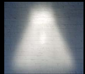
Trapezoidal Flood Beam (U-H7619)

NITE-EYES™ contain a GE sealed beam, part number H7609 or H7619. The trapezoidal beam shape is specially designed to elongate and provide controlled light while the wide flood provides light that spreads out all over. Both lamps will really illuminate your work area!