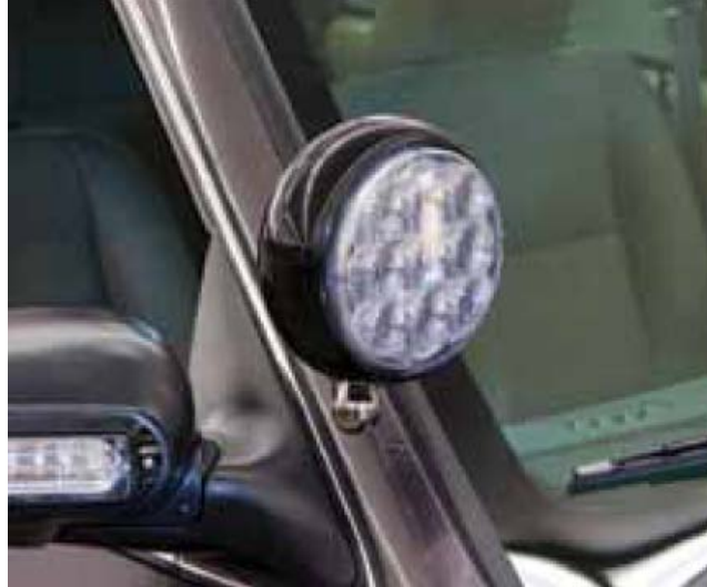
Powered by Whelen SUPER-LED®

Unity Manufacturing has provided top quality emergency and auxiliary lighting products since 1918. Unity's Post-Mount Spotlight comes in a rugged, high-impact ABS Chrome or Black housing to provide unmatched performance, reliability, and durability. The Spotlight utilizes LED technology rated at 2000 lumens output, 30 watts, and up to 50,000 hours lamp life. The lamp has a replaceable, hard-coated, polycarbonate lens that is break resistant, virtually indestructible. The instantly aimable light is easy for anyone to use. Whether you need additional light to illuminate your work area, to help you find street signs or house numbers, or to follow the path of a broken power line, the UNITY®LED post-mount spotlight is a bright idea for any vehicle! sm